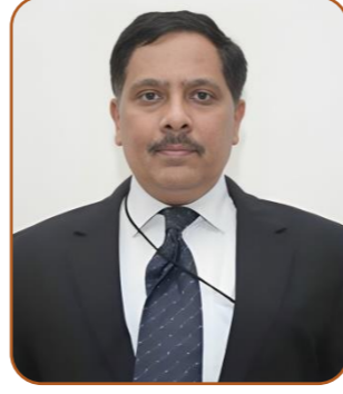
Rajesh Agrawal Ex-MRS, Railway Board Ministry of Railways