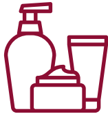
Personal Care & Cosmetics