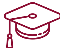
Education & Training