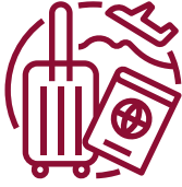
Halal Travel & Tourism