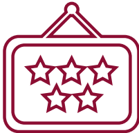
Halal Certification Bodies